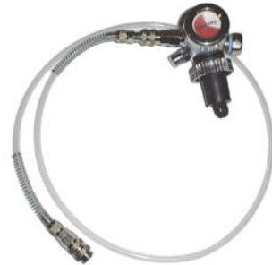
High Pressure Regulator Up to 300 bar (Included as standard with F4001 and F4001 ED)