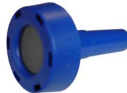
8103560 Draeger Oil Impactor