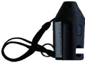
F2187 Tube Tip Cutter (included as standard)